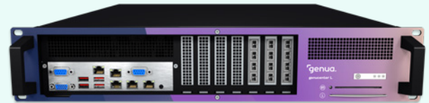
genucenter is available as virtualized solution and rack system

genucenter also enables the capturing of logs and status information as well as real-time statistics for individual systems. Various interfaces are provided for integration into existing monitoring systems.